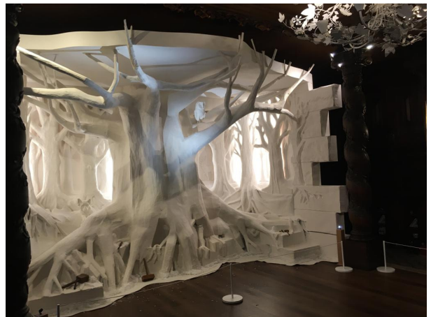
One of the Nordic trees

We then reboarded the coach for the short hop to Chatsworth itself, arriving a quarter of an hour before our scheduled entry time (really good for those in wheelchairs or slow-walkers). This year's concept was 'Nordic', so the house was decorated throughout with snow scenes and massive trees with trolls peeping out everywhere.