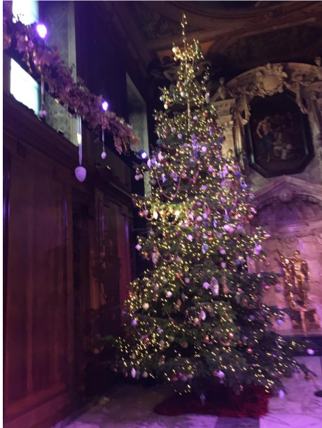
One of the beautiful Christmas trees at Chatsworth

At 4.00 pm it was time to get back on the coach to start the journey back through the gloaming to Macclesfield and on to home.